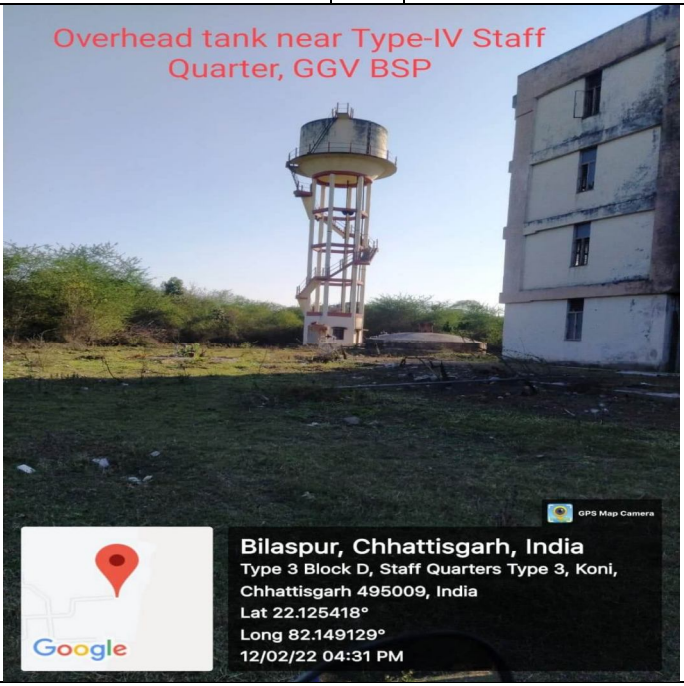
Near Type IV Staff Quarter